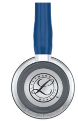
27" navy 3M6154