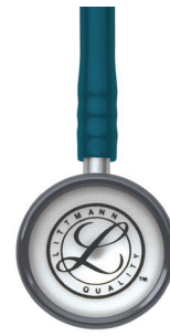
caribbean rainbow 3M2153