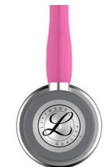
27" rose pink 3M6159