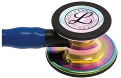
navy / rainbow / black 3M6242