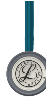
caribbean blue 3M5623