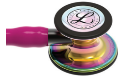
raspberry / rainbow / smoke 3M6241