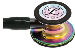
black / rainbow / black 3M6240