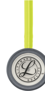
lemon lime 3M5839