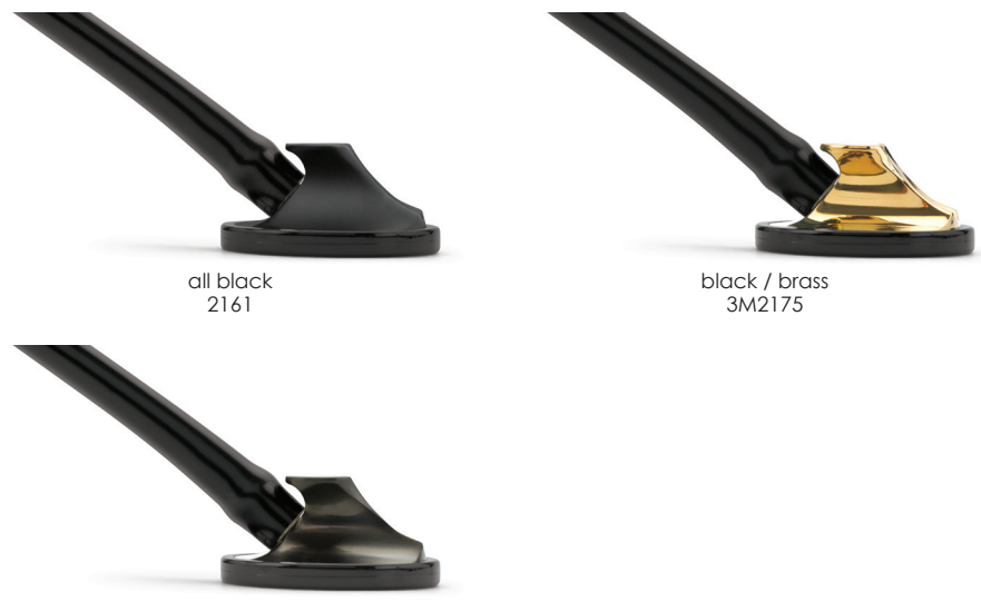
all black 2161 black / brass 3M2175 black / smoke 2176