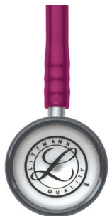
raspberry rainbow 3M2157