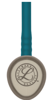
caribbean blue 2452