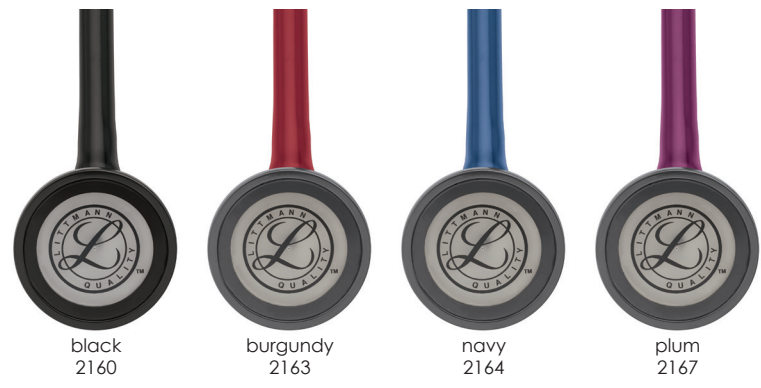
black 2160 burgundy 2163 navy 2164 plum 2167