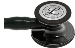
black / smoke / black 3M6232