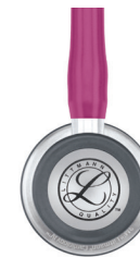
27" raspberry 3M6158