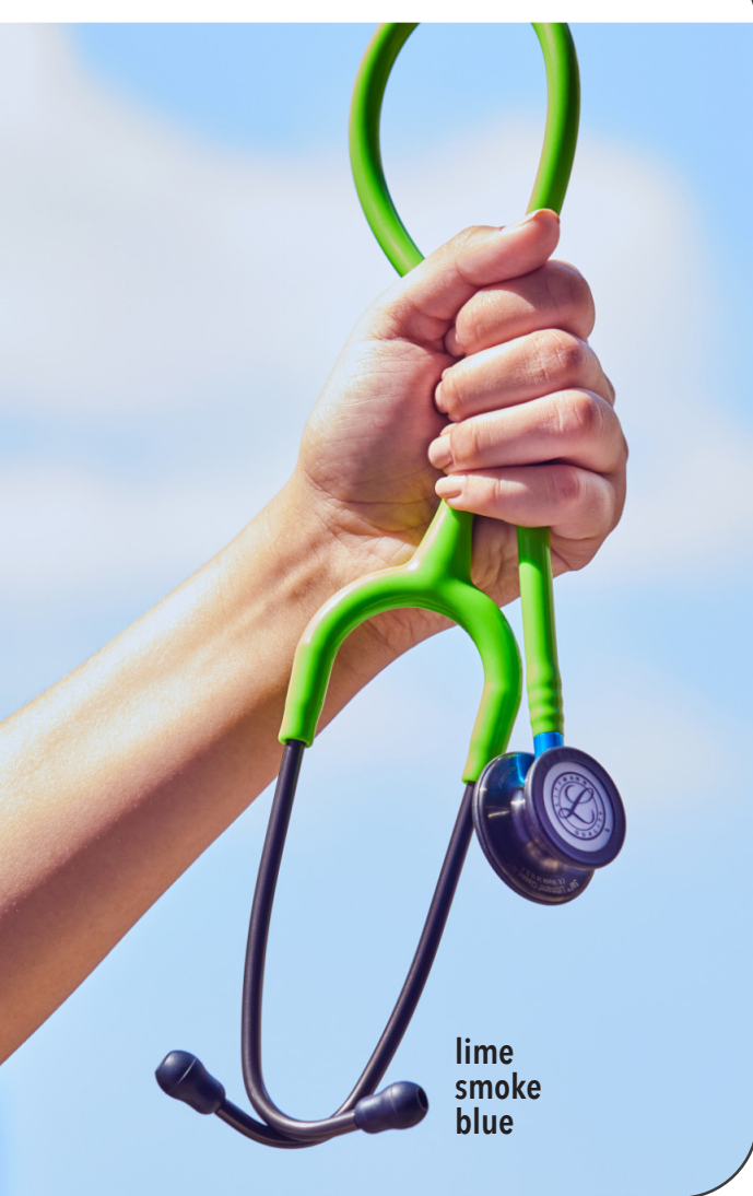
lime smoke blue