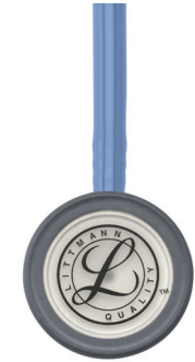
ceil blue 3M5630