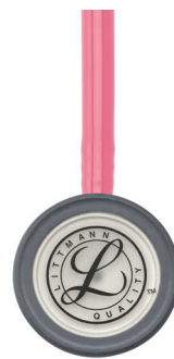
pearl pink 3M5633