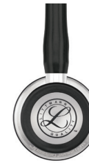
27" black 3M6152