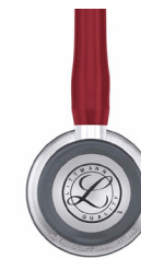
27" burgundy 3M6184