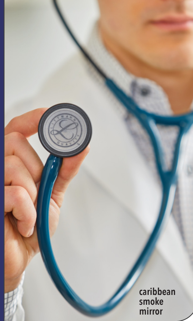
caribbean smoke mirror

Outstanding acoustics with better audibility of high-frequency sounds