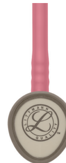
pearl pink 2456