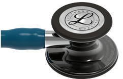
caribbean / smoke / mirror 3M6234