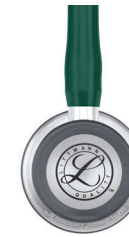
27" hunter 3M6155