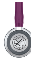
27" plum 3M6156