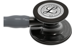
gray / smoke / smoke 3M6238