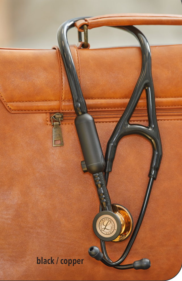
black / copper

Connects to Eko software to record, visualize and share heart sound waveforms