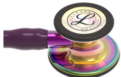
plum / rainbow / violet 3M6239