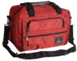
MULTIPOCKET MEDICAL BAG

McCoy carries a wide variety of bags to fit all your program needs. From totes and backpacks to medical bags with multiple pockets, we can help you find the bag that best fits your program, budget and deadline.