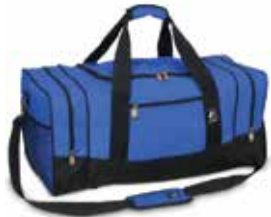
CROSSOVER DUFFLE BAG