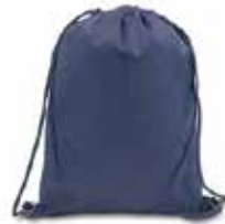
DRAWSTRING CINCH BACKPACK