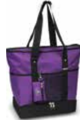
DELUXE DAYTIME TOTE