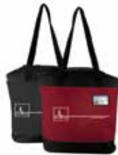
ZIPPERED KIT BAG