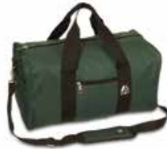
GEAR BAG MEDIUM