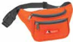
STANDARD WAIST PACK