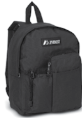
MULTIPOCKET MINI BACKPACK