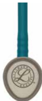
caribbean blue 2452