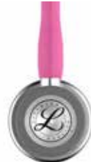
27" rose pink 3M6159