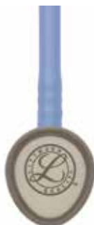
ceil blue 2454