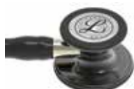
black / smoke / champagne 3M6204