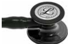
black / smoke / black 3M6232