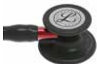
black / black / red 3M6200

Your Cost: $174.98-$187.24 | SRP: $260.90-$278.90