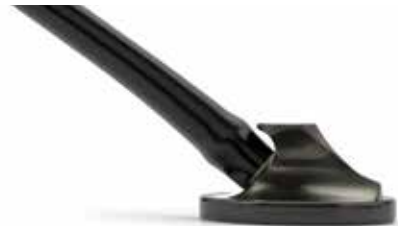
black / smoke 2176