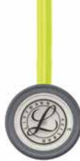
lemon lime 3M5839