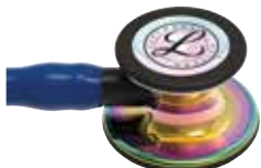
navy / rainbow / black 3M6242