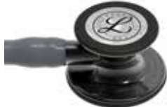
gray / smoke / smoke 3M6238