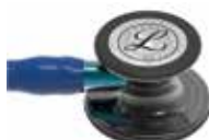
navy / smoke / blue 3M6202