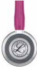
27" raspberry 3M6158