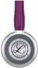
27" plum 3M6156