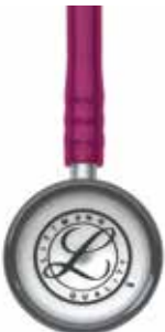
raspberry rainbow 3M2157