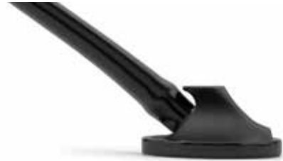
all black 2161