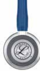
27" navy 3M6154