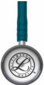
caribbean rainbow 3M2153