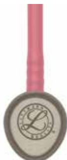
pearl pink 2456