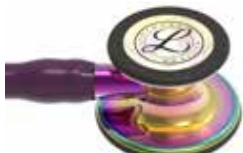
plum / rainbow / violet 3M6239