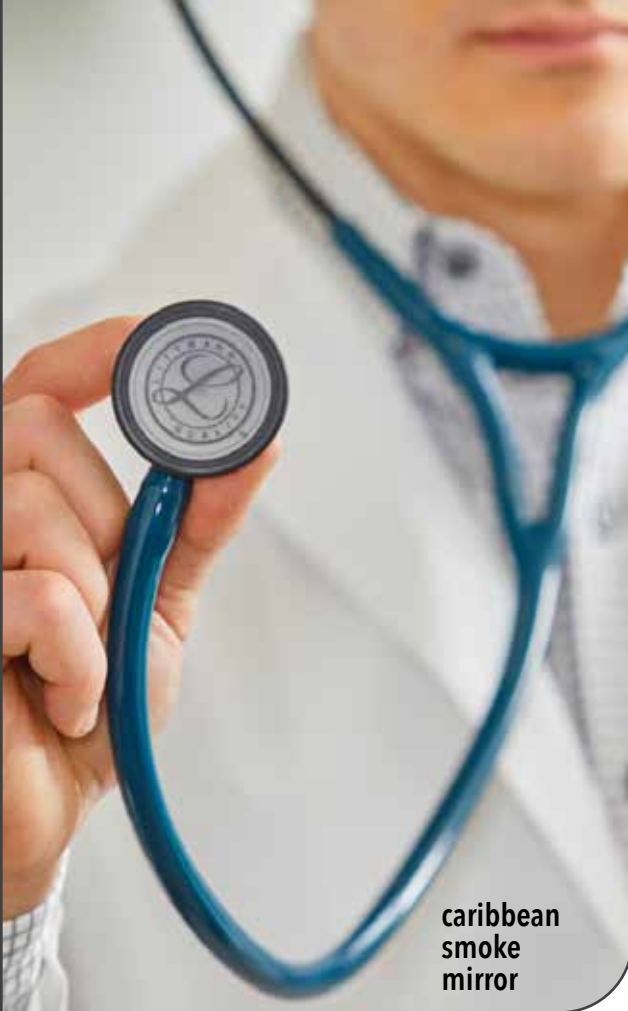
caribbean smoke mirror

Outstanding acoustics with better audibility of high- frequency sounds