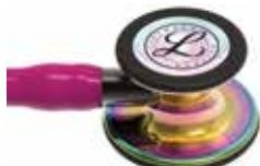
raspberry / rainbow / smoke 3M6241