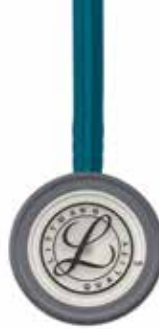
caribbean blue 3M5623