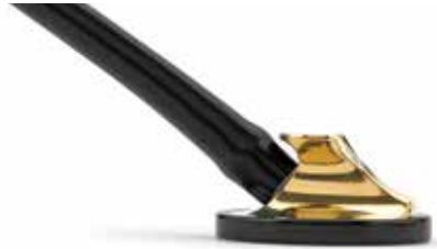
black / brass 3M2175