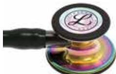
black / rainbow / black 3M6240