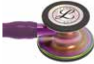
plum / rainbow / violet 3M6205