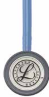
ceil blue 3M5630