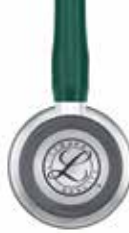
27" hunter 3M6155