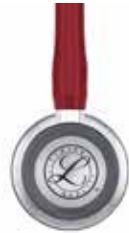
27" burgundy 3M6184