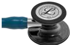
caribbean / smoke / mirror 3M6234