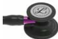
black / black / violet 3M6203