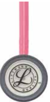
pearl pink 3M5633