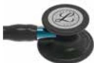
black / black / blue 3M6201