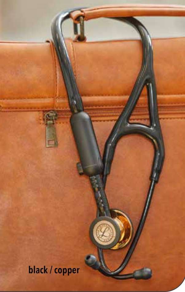
black / copper

Connects to Eko software to record, visualize and share heart sound waveforms