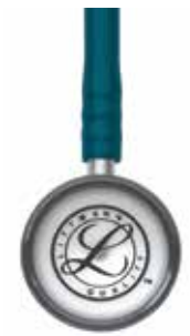
caribbean rainbow 2153