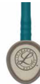
caribbean blue 2452