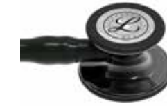
black / smoke / black 6232