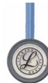
ceil blue 5630