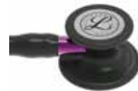
black / black / violet 6203