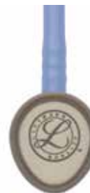
ceil blue 2454