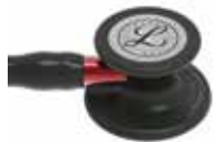
black / black / red 6200

Your Cost: $174.98-$187.24 | SRP: $260.90-$278.90