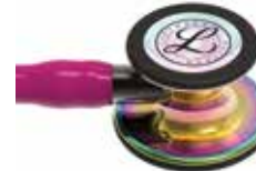
raspberry / rainbow / smoke 6241