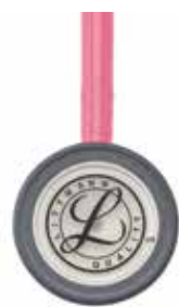
pearl pink 5633