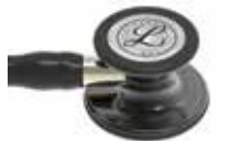
black / smoke / champagne 6204