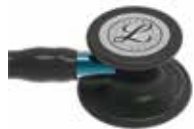
black / black / blue 6201