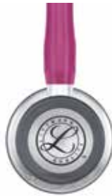
27" raspberry 6158