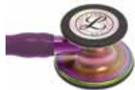
plum / rainbow / violet 6205