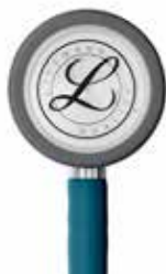
caribbean blue 5623C