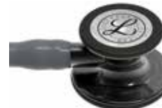
gray / smoke / smoke 6238