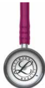
raspberry rainbow 2157