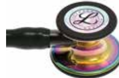
black / rainbow / black 6240