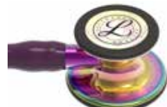
plum / rainbow / violet 6239