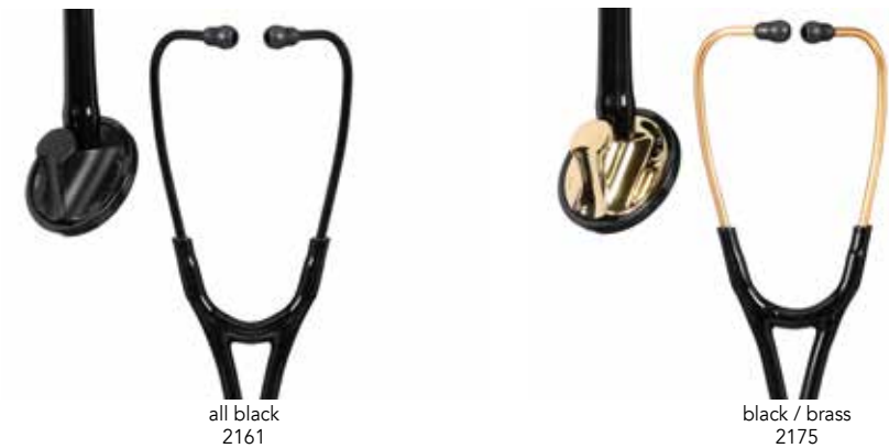
all black 2161