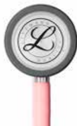
champagne rose 5910C