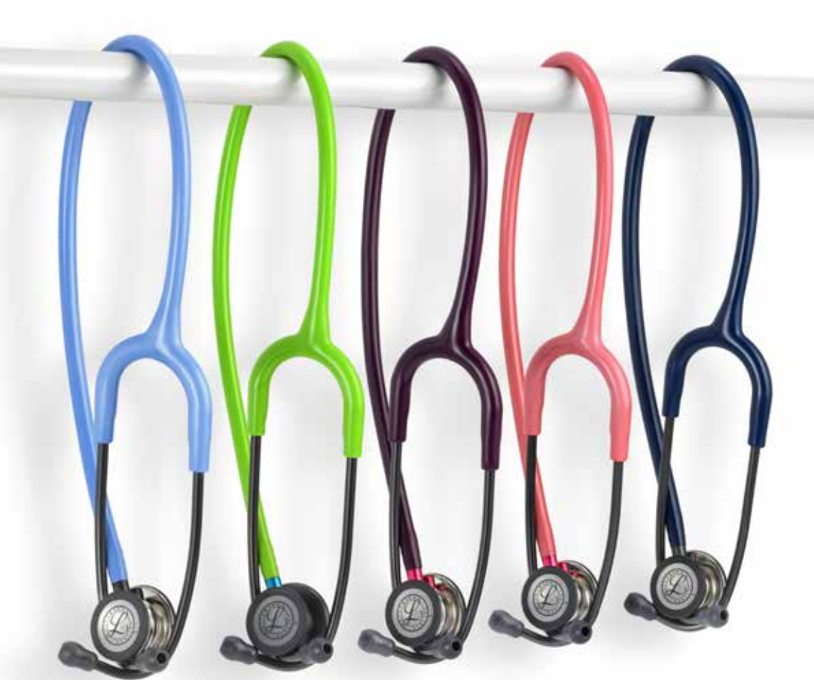
ceil blue lemon lime burgundy pearl pink navy