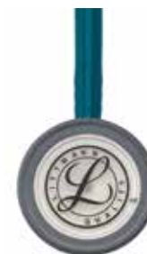
caribbean blue 5623