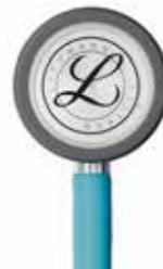
marine blue 5912C