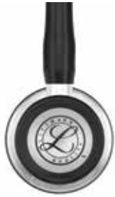
22" black 6151