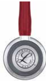
27" burgundy 6184