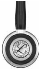
27" black 6152