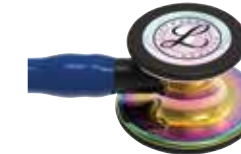
navy / rainbow / black 6242