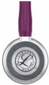
27" plum 6156