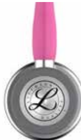
27" rose pink 6159