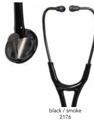
black / smoke 2176