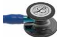
navy / smoke / blue 6202