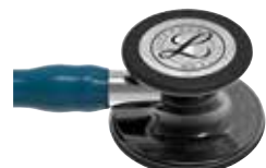
caribbean / smoke / mirror 6234