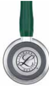
27" hunter 6155