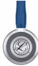
27" navy 6154