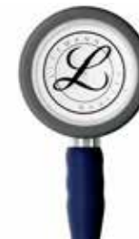
midnight blue 6187C