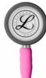
rose pink 6159