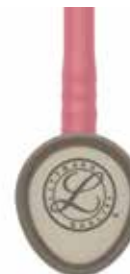
pearl pink 2456